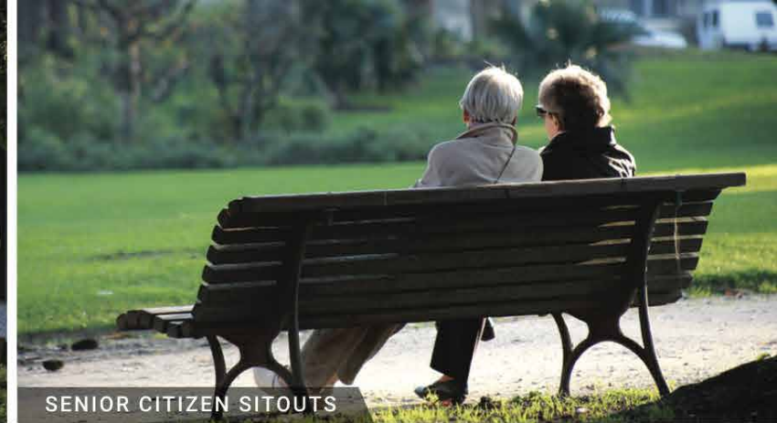
SENIOR CITIZEN SITOUTS