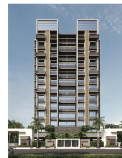
GRAND VISTA, ULWE