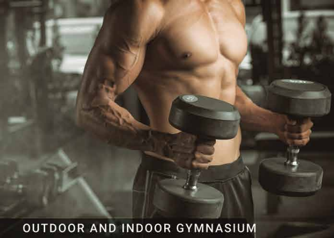
OUTDOOR AND INDOOR GYMNASIUM