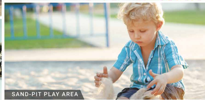
SAND-PIT PLAY AREA