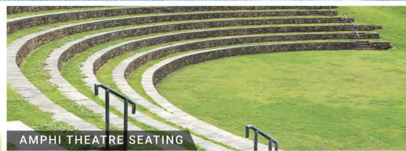
AMPHI THEATRE SEATING